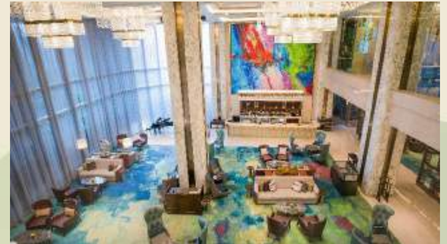
Intercontinental Hotel, Pondok Indah